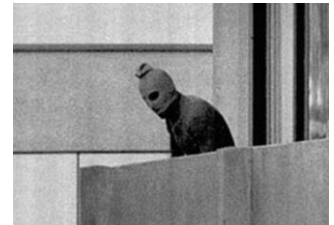
A masked terrorist on top of the balcony during the Munich massacre of 1972.

Terror: Munich 1972 - video clip of opening scene