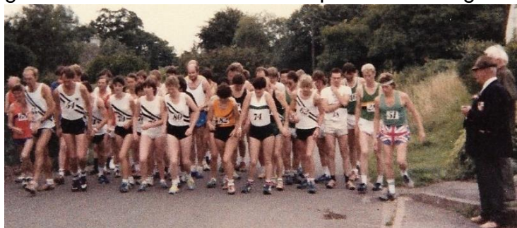
Photo 1 is from a start line at Briantspuddle