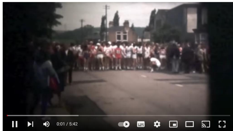
England National 30kms race walk champs 1978