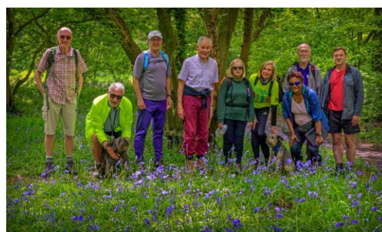
Brian Boggenpoel's picture showing some participants in Bluebell Woods near the Social Walk end

Chris mentions our photographer - Brian - who again captured a Centurions Social Walk. His excellent pictures can be viewed here .