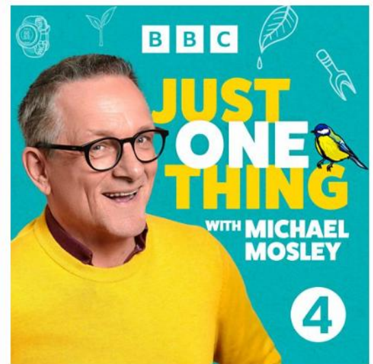
Listen to Just One Thing: Nordic Walking