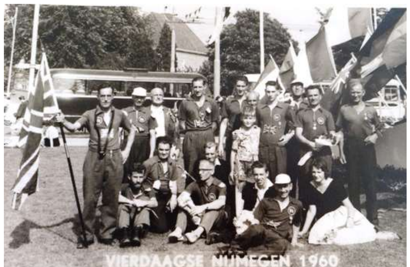
The 1960 RWA team

Whew! 270km or 168 miles – That is some going!