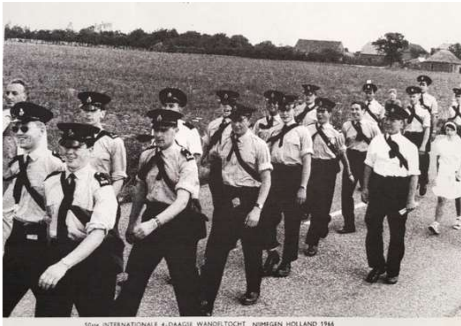
50th INTERNATIONALE 4-DAGGE WANDELTOCHT NIJMEGEN HOLLAND 1966

grimace. In the newspaper article dated 1969 it mentions that 17,000 from 21 different countries took part. Now 47,000 participate!