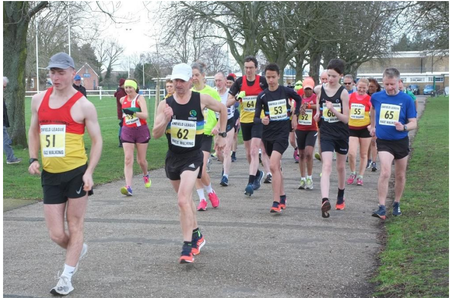
More on Enfield & Haringey website