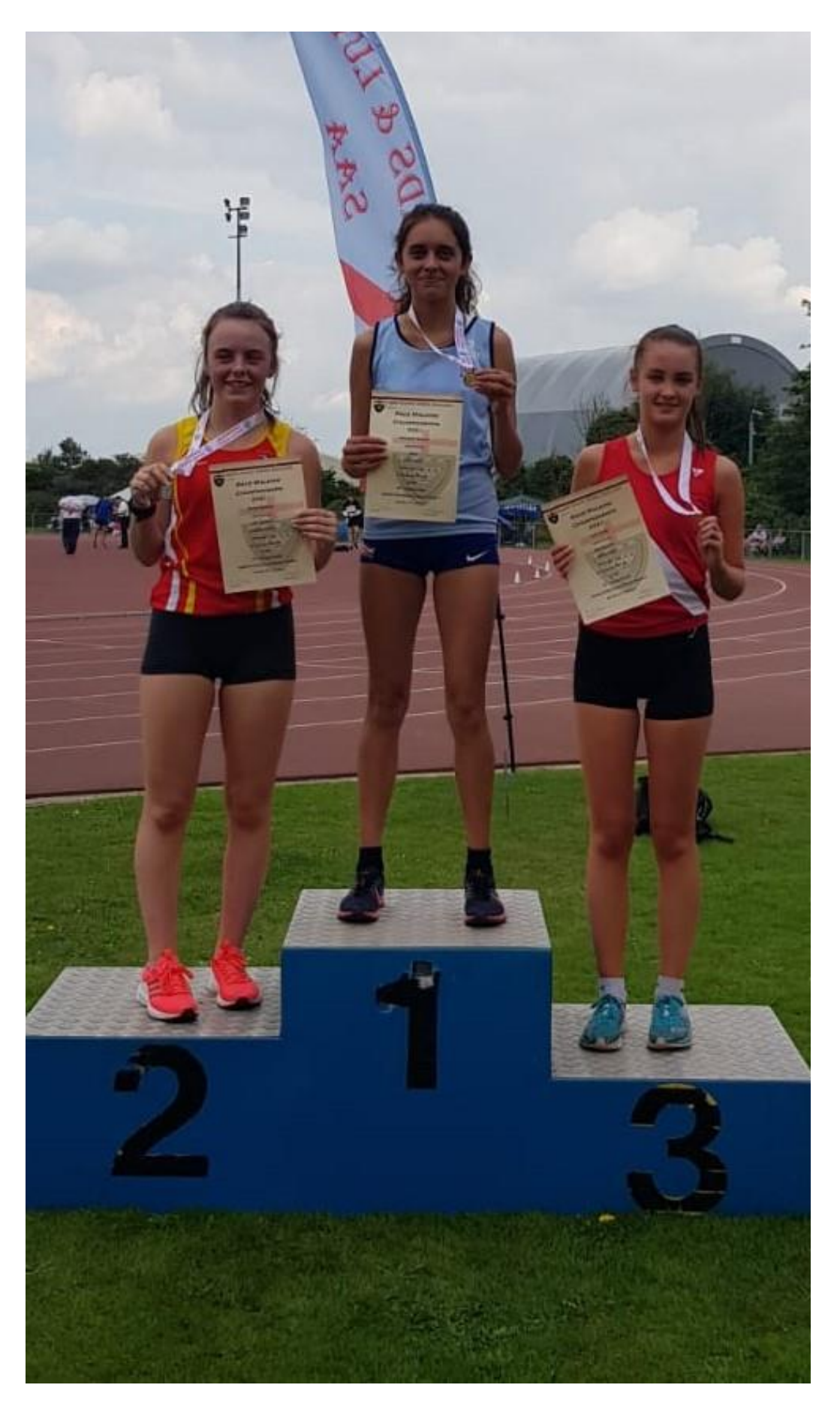
English Schools Championships Senior Girls Podium